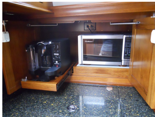
Pull-out shelf for espresso machine