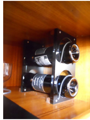
One of three wine storage racks