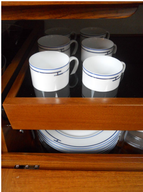
Custom dish storage