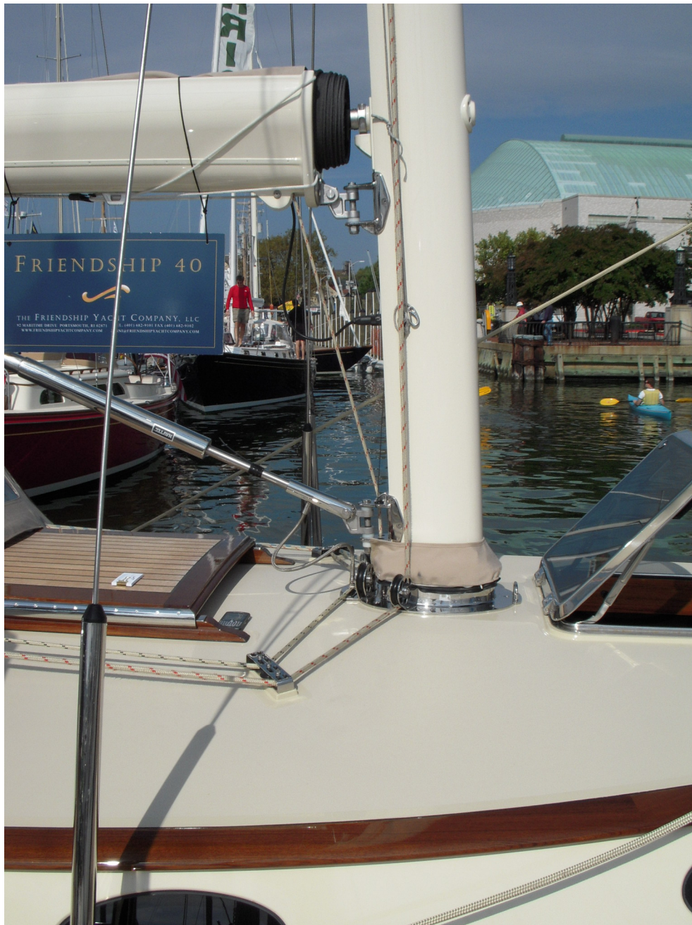
Stainless steel hydraulic vang, in-boom main furler, and mast collar with custom built-in stainless steel turning blocks.

FRIENDSHIP YACHT COMPANY PO Box 4037, Middletown, RI 02842 USA Tel: +1 (401)241-0673, Email: ted@fontainedesigngroup.com www.friendshipyachtcompany.com