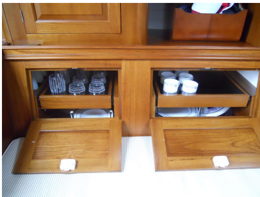
Custom dish storage

SOONER SCHOONER has been described as the perfect boat for “8 to sail; 6 to eat; 2 to sleep.” While SOONER SCHOONER is intended to accommodate a couple for an overnight, the settees are long and wide to sleep additional friends or family. There is a flat screen with DVD player in the salon, and an interior/external audio system with sat radio and ipod hook up. The galley incorporates a deep refrigerator, microwave, two-burner propane stove, and gourmet espresso maker. There is custom storage for wine in a locker as well as the fridge, and a custom varnished teak knife rack. The head features a fresh water, electric flushing head, shower, and full-length mirror.