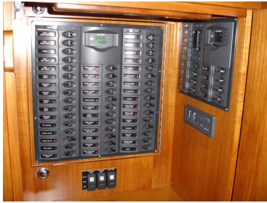
Hidden electrical panel