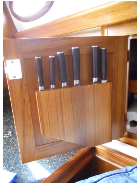
Custom knife rack